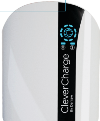
CLEVERCHARGE HOME CHARGER